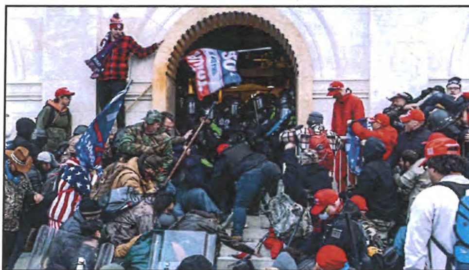
Photograph of the Capitol on January 6, 2021 115