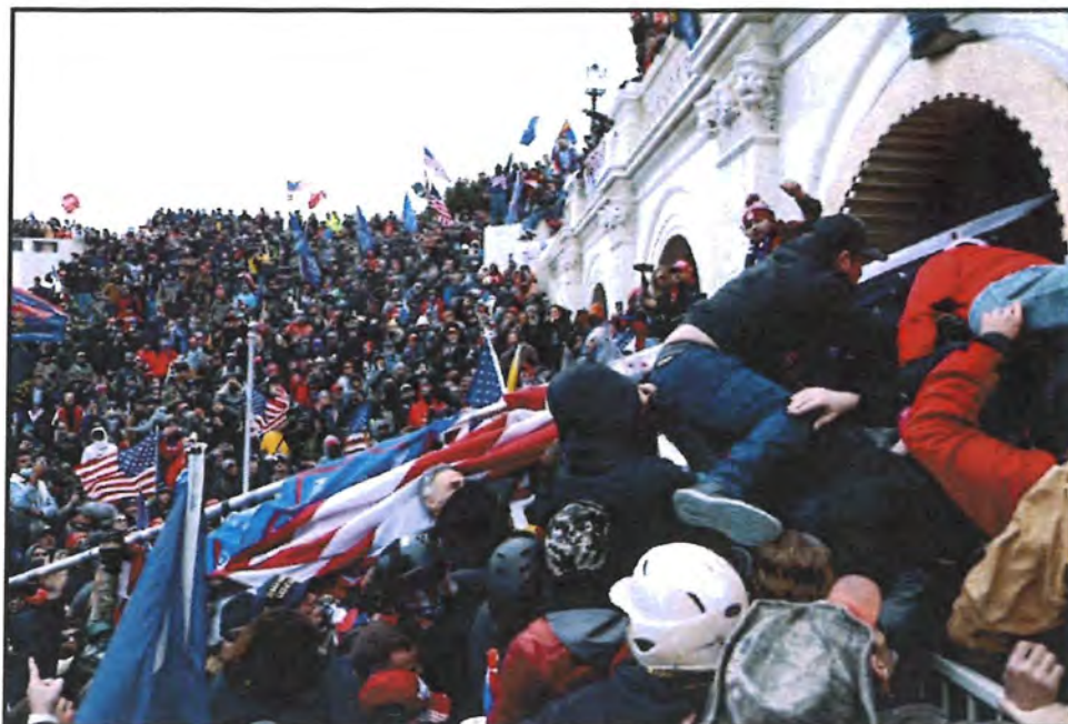
Photograph of the Capitol on January 6, 2021 114